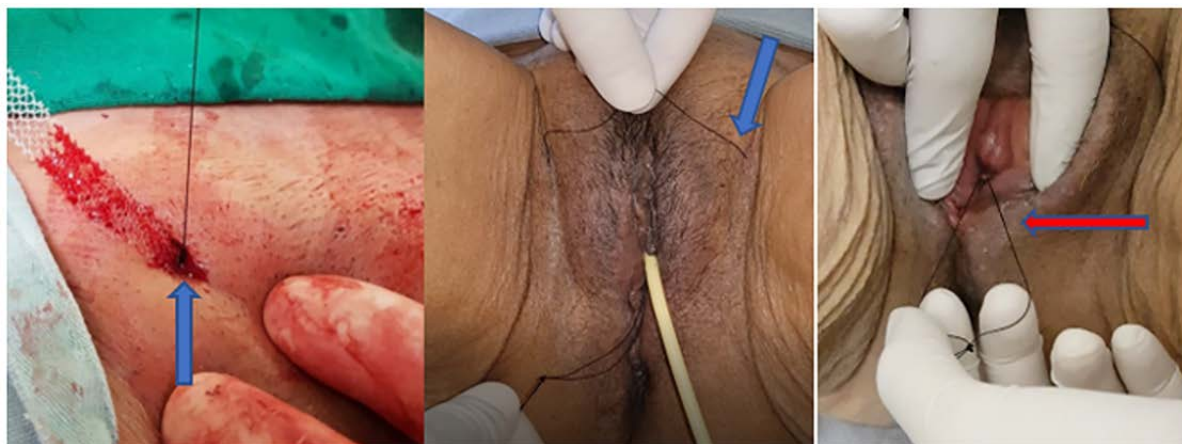
Figure 2 - Central thread for loosening. Positioned 1-2cm laterally to the urethral midline, so the mesh does not come out through the vaginal suture if loosening is necessary.

Figure 1 - Blue arrow: retropubic (left) and transobturator (middle) threads for tightening, red arrow: thread for loosening.