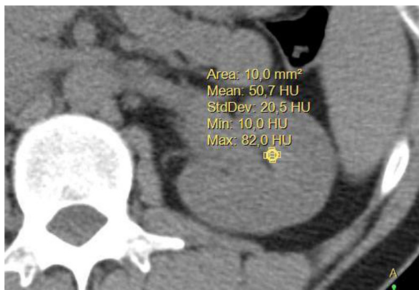
Figure 1 - CT with measurement of renal papilla with an area of 10mm 2 , obtaining the mean of this area in Hounsfield units.

The mean density of the renal papillae in Group 1 was 32.26 (4.07) HU and 42.36 (8.03) HU in Group 2 ( P=0001 ). A ROC curve was constructed in order to establish an optimum cut-off point in the papillary density (Figure-2), with a value of