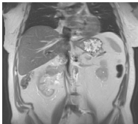
Figure 1 - MRI of abdomen.

On an axial view of the abdomen, the level II thrombus was seen pre-operatively. This was determined to be a level II thrombus.