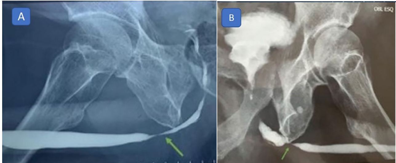
Figure 2 - Voiding cystourethrogram: (A) Case 1 - Male, 67-year old, with a history of straddle injury to the urethra presented with penobulbar urethral stricture, (B) Case 2 - Male, 59-year old, with a history of symptomatic benign prostatic hyperplasia was submitted to transurethral resection of the prostate twice, presenting recurrent bulbar urethral stricture.

metry showed a maximum flow of 16.5mL/s and a bell-shaped curve. The patient has now been followed up for four months.