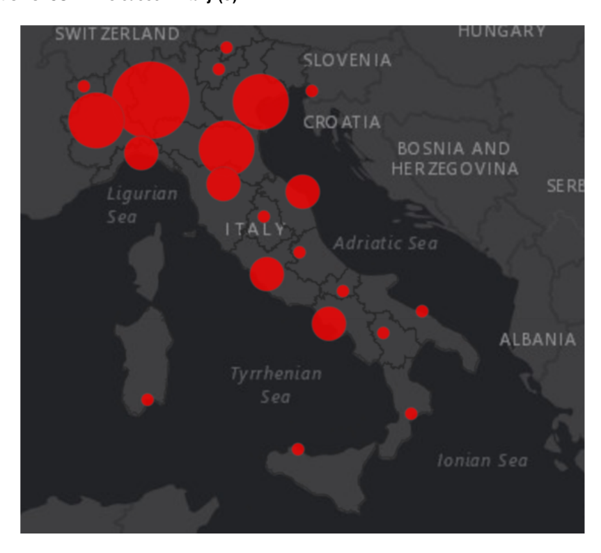
Figure 3 - Distribution of COVID-19 cases in Italy (3).

πεῖρα σφαλερή, ἡ δὲ κρίσις χαλεπή" "Vita brevis, ars longa, occasion praeceps, experimentum periculosum, iudicium difficile", we think residents should play an active role alongside the specialist by exploiting the pandemic as an unrepeatable opportunity from which to learn upon (22). In general, the COVID-19 emergency is a highly dynamic situation and the burden on the healthcare system varies daily according to the geographical region.