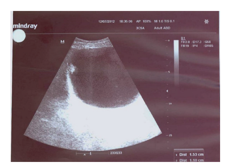
Figure 1 - Bladder ultrasonography showing the soft-tissue lesion in the right bladder wall of a girl aged 17-years.